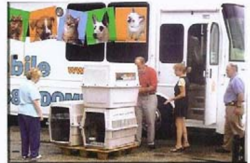
ARL staff transfers the puppies from the air kennels to cages onboard the PetMobile.

they quickly fell asleep for the last leg of their journey to West Palm Beach.