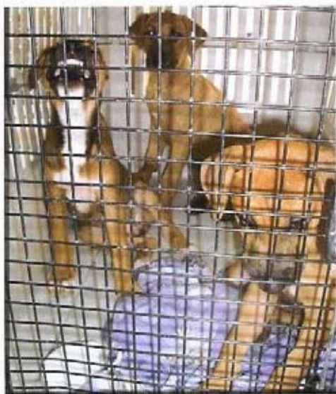
These Potcake siblings arrived together to find forever homes in West Palm Beach.

Once at the Animal Rescue League, each puppy was thoroughly evaluated by a staff veterinarian, and some puppies were treated for minor skin conditions. Once the puppies receive a clean bill of health, they are spayed or neutered, microchipped, vaccinated, and placed in adoption.